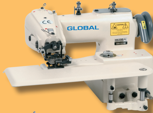
BM 9280 DD