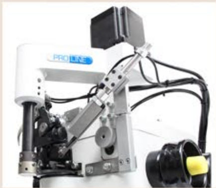
Pneumatic thread trimmer