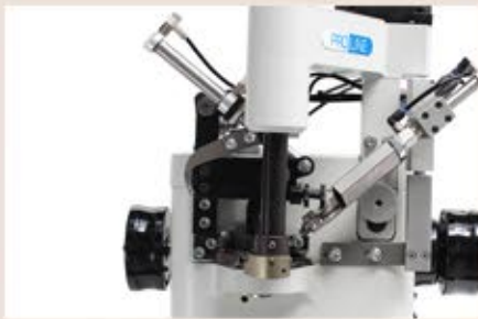
Pneumatic gathering device