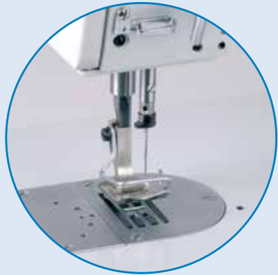
4-Row feed dog for positive fabric control