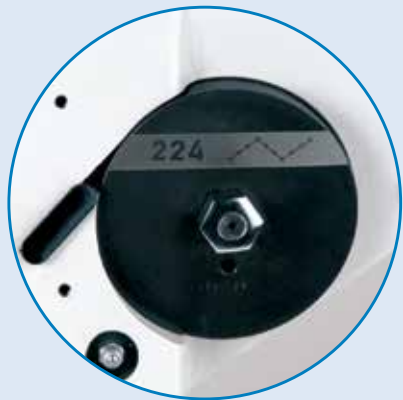
Easily inter-changeable cams