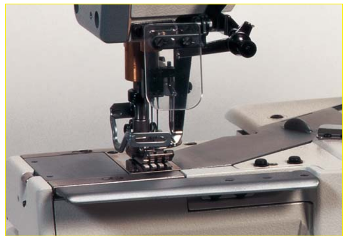
Global® model CB 2703-64 cylinder-bed model